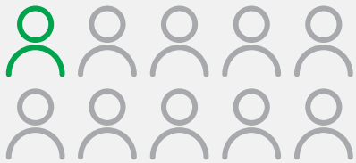
Research suggests that after the changes, fewer than one in 10 buyers will secure a Stamp Duty-free purchase

While all buyers will be affected, FTBs are likely to feel the impact most